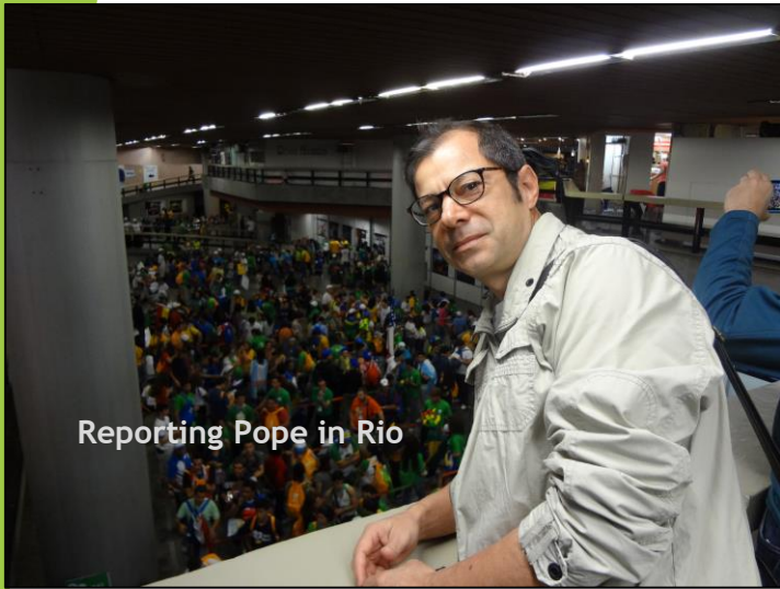
Reporting Pope in Rio