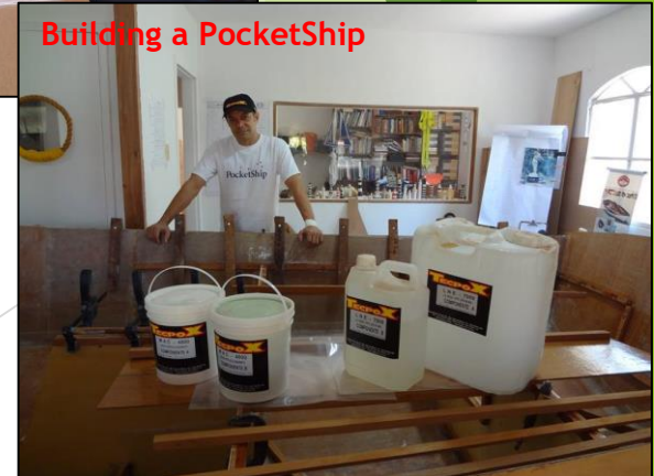
Building a PocketShip