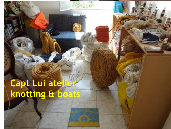
Capt Lui atelier knotting & boats