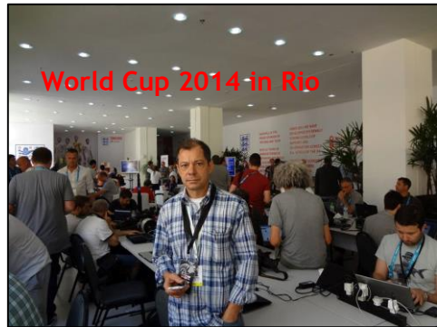
World Cup 2014 in Rio