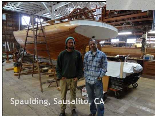
Spaulding, Sausalito, CA